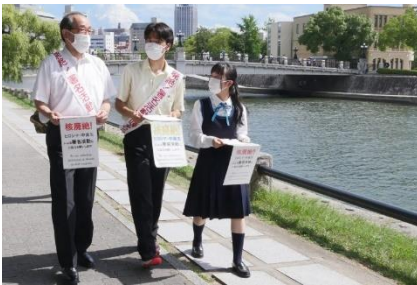
Petition Drive by the President and high school students in the street (August 2022, Hiroshima)