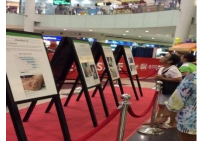
Holding the Mayors for Peace Atomic Bomb Poster Exhibition by a member city (June 2015, Muntinlupa)