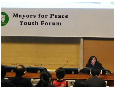
Presentation by a youth from a member city at the Mayors for Peace Youth Forum held in UNOG (April 2018, Geneva)