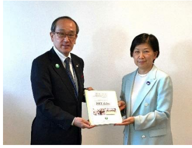
Meeting with Ms. Nakamitsu, UN Under-Secretary-General and High Representative for Disarmament Affairs (June 2022, Vienna)