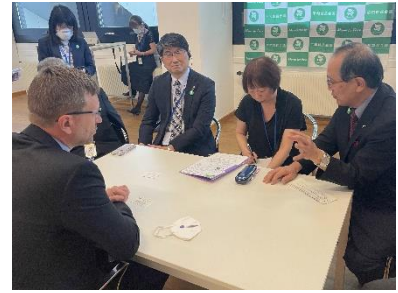
Meeting with national government representatives (June 2022, Vienna)