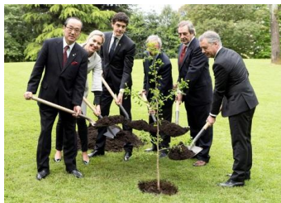
Planting ceremony of a second generation atomic-bombed Ginkgo seedling by a member city (April 2018, Guernika-Lumo)