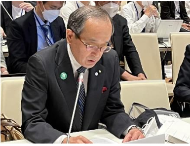
Speech by the President at the first Meeting of States Parties to the Treaty on the Prohibition of Nuclear Weapons (June 2022, Vienna)