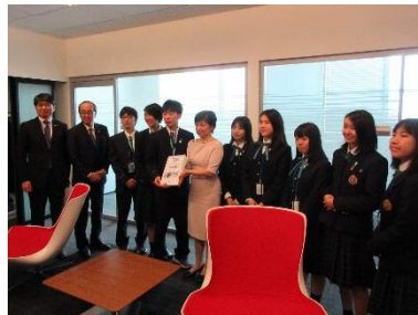
Presenting signatures to the representatives of UN by high school students participating in the petition drive (April 2019, New York)