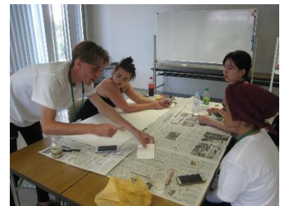
Discussions at the Mayors for Peace Youth Exchange for Peace: Support Program for "HIROSHIMA and PEACE" by youths from member cities (August 2019, Hiroshima)