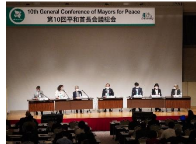
10th General Conference (October 2022, Hiroshima)

Mayors for Peace holds a General Conference once every four years in principle. Hosted alternately between Hiroshima and Nagasaki, the General Conference is an opportunity for member cities to decide and adopt agenda items significant to the organization.